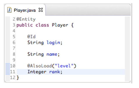
Fig. 3: Lazily migrating legacy entities: A developer has renamed attribute level to rank . Annotation @AlsoLoad ensures that a legacy attribute level can still be loaded and will be renamed to rank .

NoSQL data stores by providing so-called life-cycle annota tions , e.g., Objectify [12] (for Google Cloud Datastore) and Morphia [13] (for MongoDB).